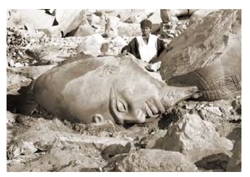
Laying colossus of Ramesses II in 1863.