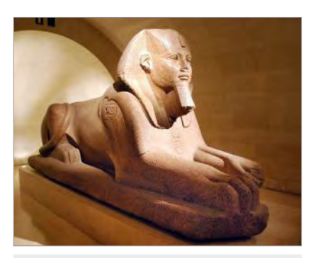
Great sphinx from Tanis in the Louvre Museum.

Since 1965, Montet's work is continued by the Mission française des fouilles de Tanis . The French team devotes its activities to the methodical re-examination of the areas explored in the past, to the excavation of new sectors, to the global study of the site (geophysical, ceramological, geomorphological surveys) and to the scientific and patrimonial valorization of the discovered remains (epigraphy, architecture, topography, protection and conservation).