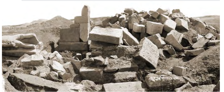
The monumental gateway, before its excavation.

Four limestone wells were used for water rituals in the temple of Amun. Three of them, built North of the forecourt, date from the Late Period. The fourth one, within the first courtyard, is earlier (probably Shosheng III).